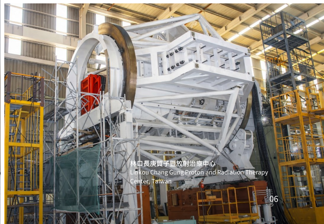
林口長庚質子暨放射治療中心 Linkou Chang Gung Proton and Radiation Therapy Center, Taiwan.