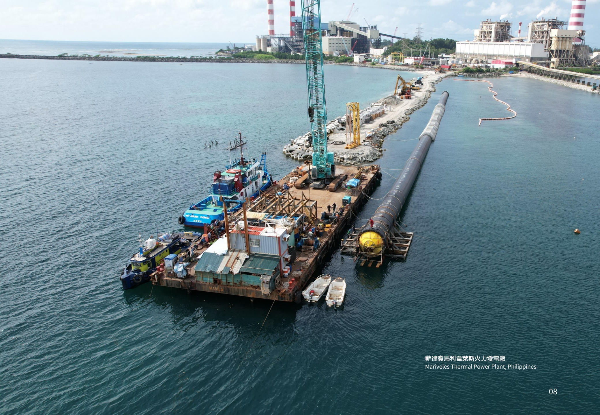
菲律賓馬利韋萊斯火力發電廠 Mariveles Thermal Power Plant, Philippines