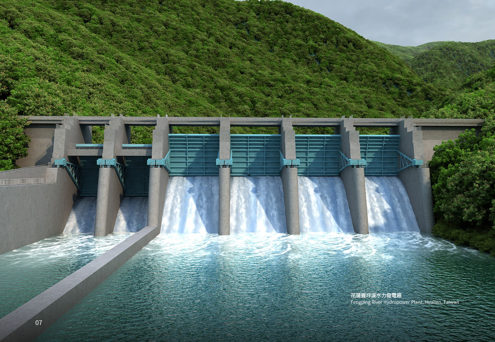
花蓮豐坪溪水力發電廠 Fengping River Hydropower Plant, Hualien, Taiwan